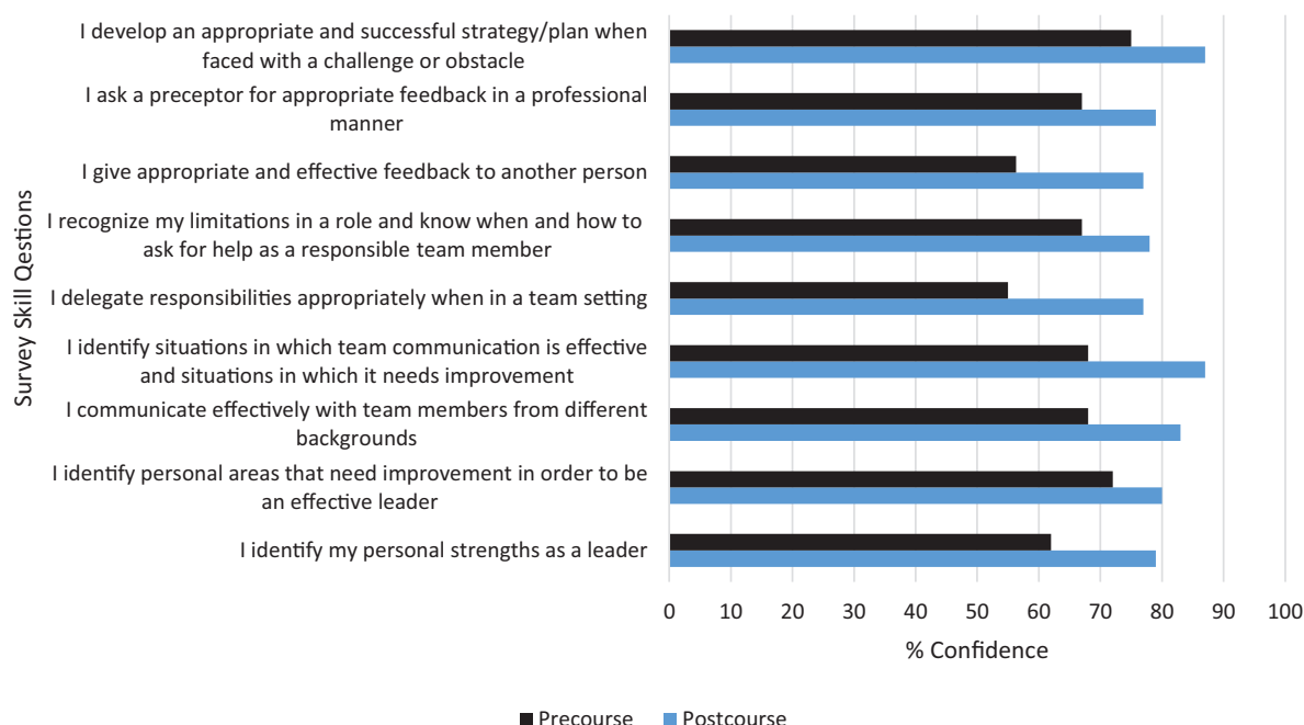
Figure 2. Participant confidence in ability to utilize pertinent knowledge and skills (Kirkpatrick level 2). Participants rated their confidence in skills and knowledge before and after the program on a scale of 1 (not at all confident) to 100 (very confident). Participant responses in the pilot ( N = 12 ) and second ( N = 14 ) sessions were combined, and means were calculated for each item. The pre- and postcourse responses are statistically significant ( p < .001 ), as determined by paired t test.

student from the pilot course completed this survey (one of 12 participants, completion rate: 8%). However, results indicate that course skills were very applicable to daily life; this participant incorporated leadership style insight, as well as practicing giving feedback and delegating responsibilities in relation to obtaining two new leadership positions in medical extracurricular activities. The posttraining survey was not distributed in the second course offering. Long-term skill utilization was assessed via the postcourse evaluation, on which all students appropriately projected anticipatory skill utilization as a surrogate marker for future application (Table 2).